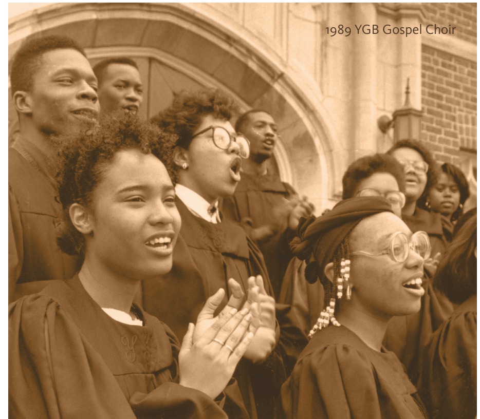
1989 YGB Gospel Choir

A tradition for Grinnell College students since 2006. The extravaganza, which occurs in the fall and spring, raises money for various LGBTQIA+ organizations both on and off campus. It is an event that encapsulates the lasting spirit of Grinnell: a celebration of diversity with a commitment to social justice. Come see what all the fuss is about.