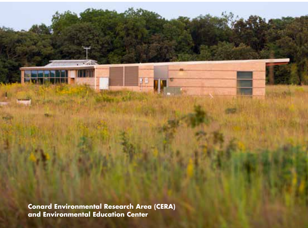
Conard Environmental Research Area (CERA) and Environmental Education Center

Please keep both your key and your P-card in the envelopes in which they came and return both in their envelopes at the end of Reunion weekend. Boxes for the return of keys and key cards are at the registration desk. There is a fine for non-returned items.